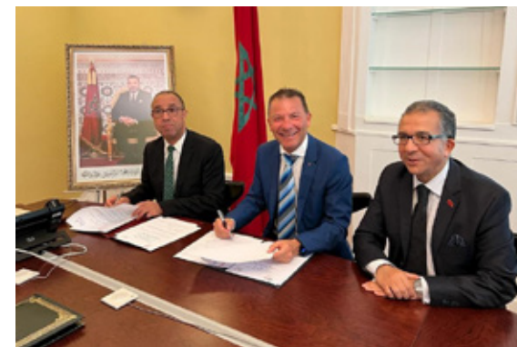
Cadi Ayyad University is the new partner university in Morocco.

were received in Kufstein from 25 nations. International delegations from Malaysia, Japan and Finland were hosted at FH Kufstein Tirol in order to discuss existing student mobility and strategic immersions. The International Relations Office is responsible for handling, expanding and cultivating the relationships of the international network.