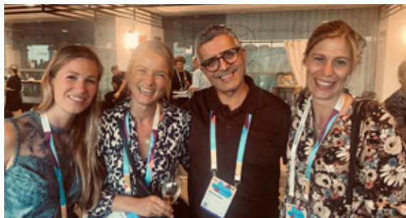
IRO Team at the EAIE in Barcelona

After more than two years, the international education community was finally able to meet again in person at the education conferences NAFSA in the US and EAIE in Barcelona. FH Kufstein Tirol took advantage of this opportunity to again engage in person with numerous partners from all over the world and solidify its excellent cooperation with its partner universities both on a bilateral level as