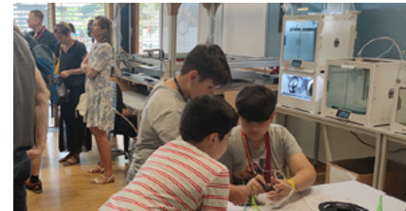
Makers Lab encouraging the youth of today.

The build-up and expansion of nine Science Labs at the University mostly occurred during the pandemic so that the public did not have access to these. The Long Night of Research now provided the first opportunity to open up the state-of-the-art infrastructure to visitors and thereby give them some insight into the University's research topics.