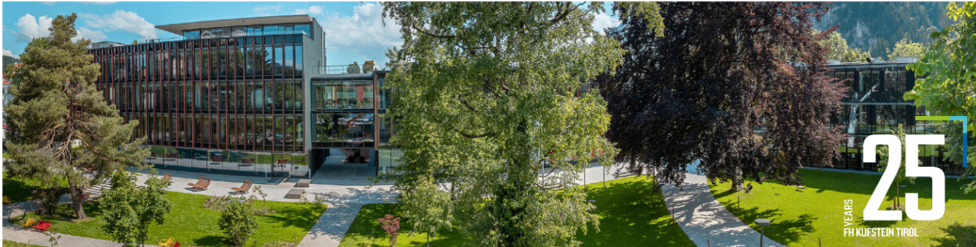
The newly designed campus of FH Kufstein Tirol: four modern building sections, the integrated library and a separate laboratory wing in the middle of the beautiful city park.