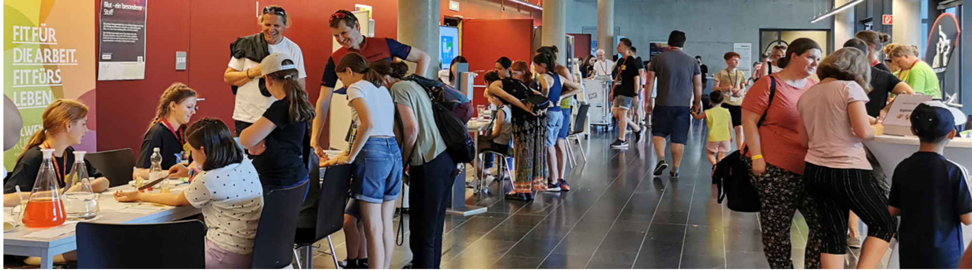
Excitement at the University of Applied Sciences due to the Long Night of Research with 950 guests in attendance.