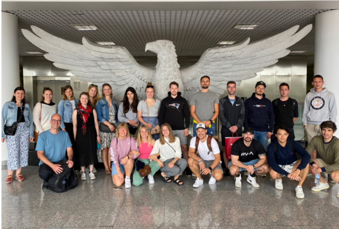
Students from the International Business Studies program explored Lisbon extensively – economically, academically and culturally.