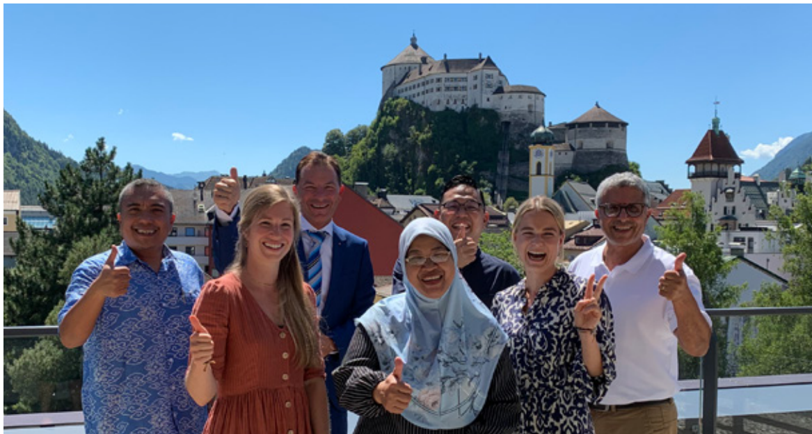
A visit from the Malaysian delegation led to an extension of the partner agreement.

After more than two years, the international education community was finally able to meet again in person at the education conferences NAFSA in the US and EAIE in Barcelona. FH Kufstein Tirol took advantage of this opportunity to again engage in person with numerous partners from all over the world and solidify its excellent cooperation with its partner universities both on a bilateral level as