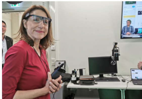
Regional Minister Mag.a Leja gives the eye tracking glasses in the human behavior lab a try.

We were also able to make progress in regard to opening up our Science Labs to schools and industry. It all started with a brief visit from Regional Minister Mag.a Leja, who was quite impressed after touring the Kufstein laboratories.